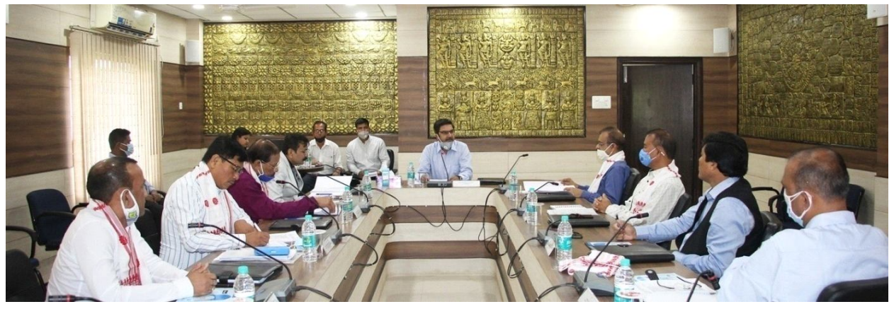
First meeting of the Executive Council held on 5th October 2020 in the conference hall of the Dibrugarh University Guest House.

As per the transitory power of the first Vice Chancellor mentioned in Clause 45(5) of the Assam Sri Sri Aniruddhadeva Sports University Act, 2018 the University constituted the Adhoc Management Committee of the University vide office order No. SADSU/CHB/5/2020 dated 16/07/2020. The first adhoc management committee meeting was held on 22/07/2020 with a detailed agenda items.